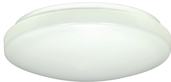
62-546 11" LED flush mount fixture