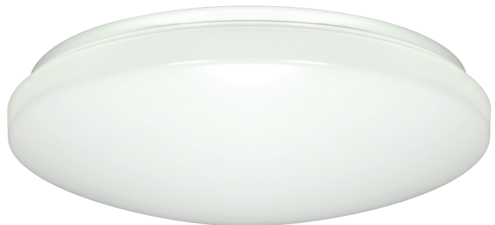
62-548 14" LED flush mount fixture