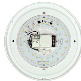
LED module and internal occupancy sensor (Functions through the outer lens)