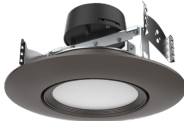
S11859 / 5-6" BRONZE