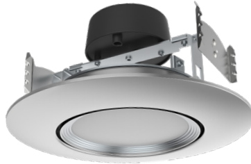
S11858 / 5-6" BRUSHED NICKEL