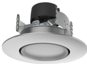
S11855 / 4" BRUSHED NICKEL