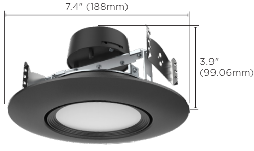
S11857 / 5-6" BLACK