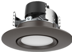
S11856 / 4" BRONZE