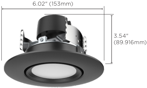
S11854 / 4" BLACK