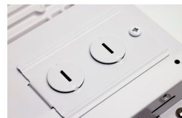
1/2" Knockouts for Easy Wiring

This device complies with Part 15 of the FCC Rules. Operation is subject to the following two conditions: (1) this device may not cause harmful interference, and (2) this device must accept any interference received, including interference that may cause undesired operation. Fixture may not be compatible with all dimmers.