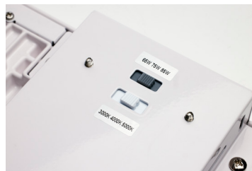
Wattage and CCT Selectable Switches (Model 65-1010 shown)