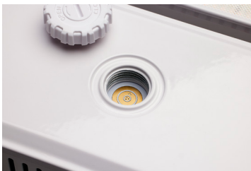
Integrated Sensor Port