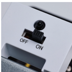
Photocell On/Off Switch