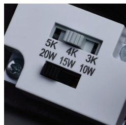
Wattage and CCT Selectable Switch

This device complies with Part 15 of the FCC Rules. Operation is subject to the following two conditions: (1) this device may not cause harmful interference, and (2) this device must accept any interference received, including interference that may cause undesired operation.