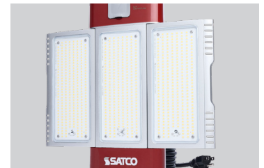
Expandable Light Panels

This device complies with Part 15 of the FCC Rules. Operation is subject to the following two conditions: (1) this device may not cause harmful interference, and (2) this device must accept any interference received, including interference that may cause undesired operation.