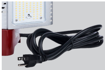
10 Foot Power Cord