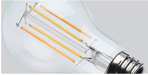
Warm Dimming 3000K-2000K