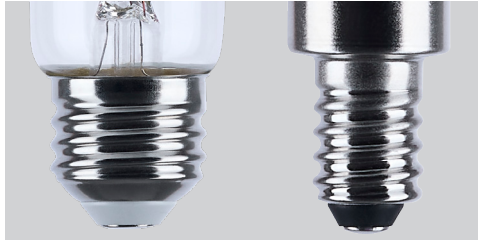
Medium or Candelabra Base