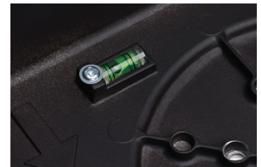
Integrated Rear-Mounted Level

This device complies with Part 15 of the FCC Rules. Operation is subject to the following two conditions: (1) this device may not cause harmful interference, and (2) this device must accept any interference received, including interference that may cause undesired operation.