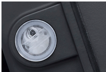
Integrated By-Passable Photocell