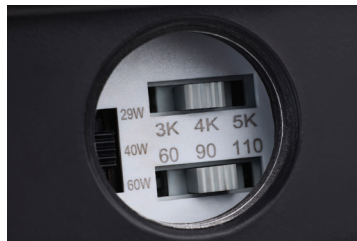
Beam, CCT and Wattage Switches