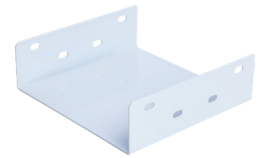
Connector plate attaches two 8' sections