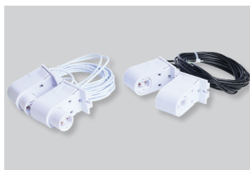
Includes Fa8 lamp holders, or choose R17d lamp holders (sold separately)