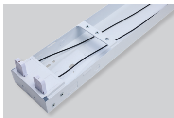
Deep channel to accommodate ballast or emergency driver where needed