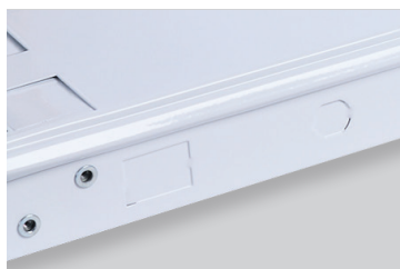
Knockouts for Convenient Wiring