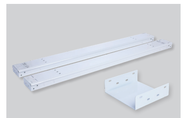
Comes with two 4' pieces and connector plate for secure assembly

Specifications are subject to change without prior notice.