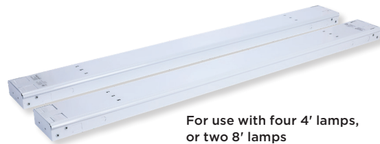
For use with four 4' lamps, or two 8' lamps