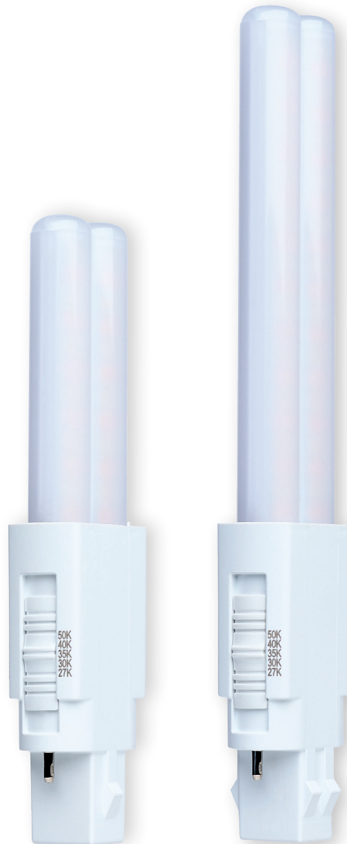
3W G23 Base