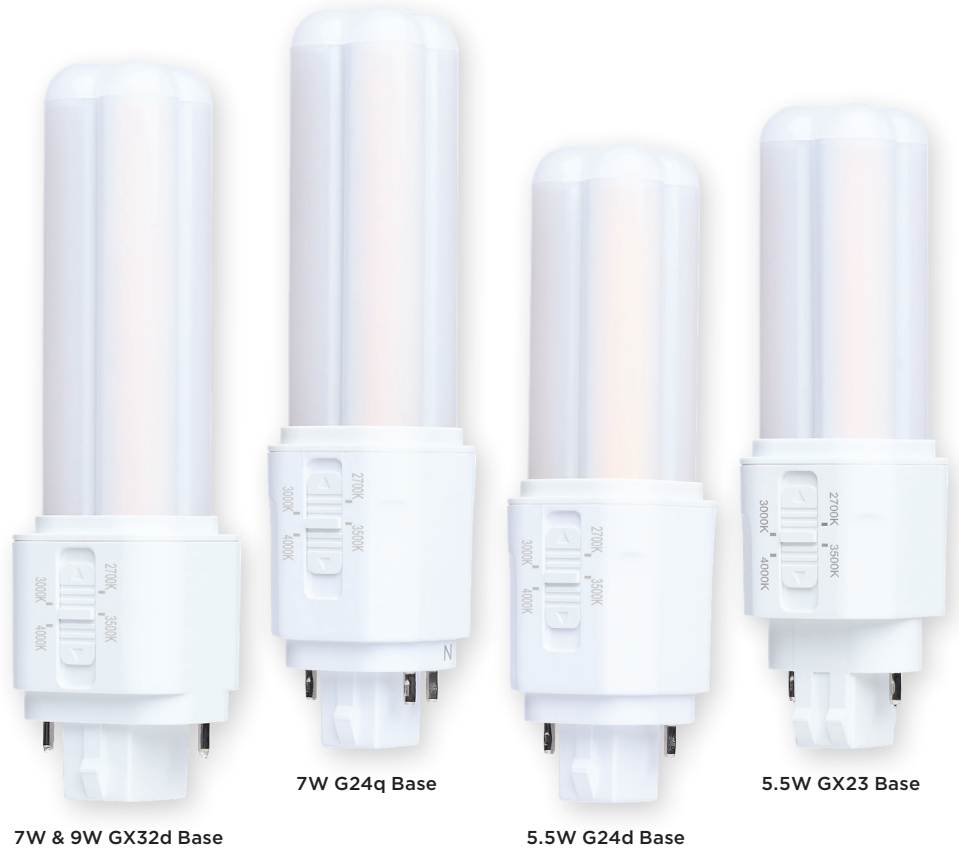
7W & 9W GX32d Base