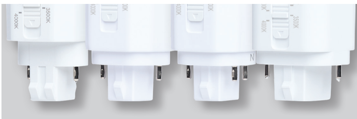
GX23, G24d, G24q, GX32d Bases Available