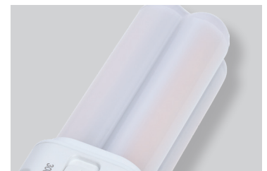
Durable Plastic Lens