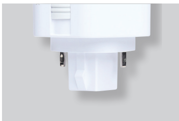
GX24d Base (compatible with GX24q, G24d, and G24q bases)