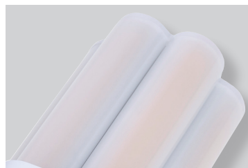
Durable Plastic Lens