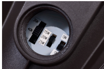
CCT & Wattage Selectable Switches