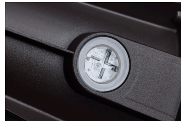
Integrated By-Passable Photocell