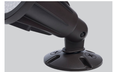
1/2" Knuckle Mount with included Mounting Plate

This device complies with Part 15 of the FCC Rules. Operation is subject to the following two conditions: (1) this device may not cause harmful interference, and (2) this device must accept any interference received, including interference that may cause undesired operation.