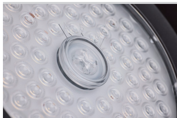
Beam Selectable Dial & IK10 Vandal Resistant Lens