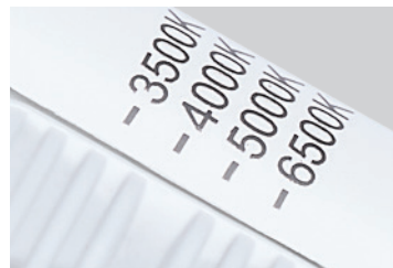
4 CCT Selectable

Dimmable with compatible ballasts. See satco.com for details. Specifications are subject to change without prior notice. Replacement wattage shown depends on application and fixture. This device complies with Part 15 of the FCC Rules. Operation is subject to the following two conditions: (1) this device may not cause harmful interference, and (2) this device must accept any interference received, including interference that may cause undesired operation. Meets requirements of ICES-005 issue 5 class A for use in commercial applications. WARNING: Some products included in this specification sheet may be subject to the warning requirements of California's Proposition 65. Please refer to your product packaging for more information. Visit satco.com/service/warranty for complete warranty details.