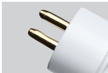
G5 Miniature Bi-Pin Base