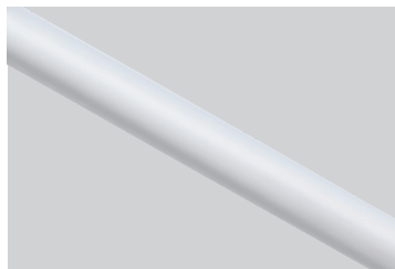
PET Coated Glass Tube