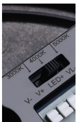
CCT and Wattage Switches