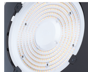
Integrated By-passable Photocell