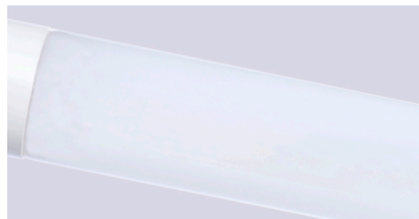
All Glass Tube with PC End Caps