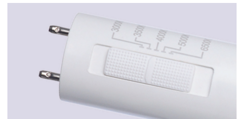
CCT Selectable Switch

This device complies with Part 15 of the FCC Rules. Operation is subject to the following two conditions: (1) this device may not cause harmful interference, and (2) this device must accept any interference received, including interference that may cause undesired operation.