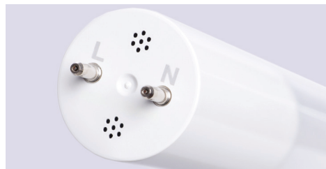
G13 Medium Bi-Pin Base